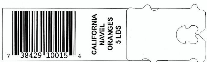
Series PFM (Left Hand)