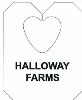
Series WP Series WP-72

HEAVY DUTY CLOSURES UP TO 15 LBS CONTENT WEIGHT