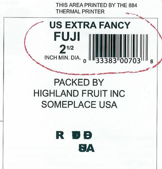
Lower portion of label custom printed