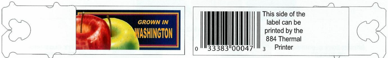
Custom Printed Front