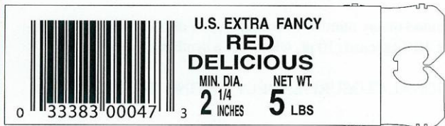
P-100: Front Printed by 884 Thermal Printer